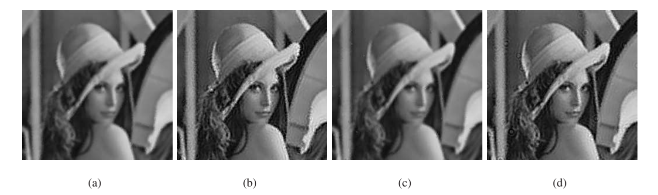
Fig. 3. Lena image blurred with out-of-focus kernel of radius 3, and then corrupted by impulse noise with s = 30% for Figs (a) and (b), and r = 25% for Figs (c) and (d). Fig (a) is the result of AMF and Fig (b) is the result by first applying AMF and then minimizing (3)–(4) with \varphi(t) = \sqrt{t^2 + 10^{-4}} and \beta = 0.01 . Fig (c) is the result of ACWMF and Fig. (d) is the result by first applying ACWMF and then minimizing (3)–(4) with \varphi(t) = \sqrt{t^2 + 10^{-4}} and \beta = 0.01 . Fig (c) is the result of \beta = 0.01 .