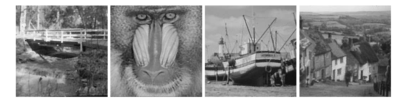
Fig. 9. The restorations of our method for images blurred with out-of-focus kernel of radius 3, and then corrupted by randomvalued impulse noise with r = 40%. The parameters used are the same as in Figure 8 when s = 40%.