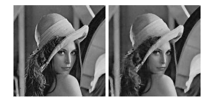
Fig. 10. Lena image blurred with different kernels, and then corrupted by random-valued impulse noise r = 40%. From left to right: The restoration of blurred image with Gaussian kernel (generated by MATLAB command fspecial ('Gaussian', [77], 1)), and the PSNR is 31.5dB; the restoration of blurred image with motion kernel (generated by MATLAB command fspecial ('motion', 9, 1)), and the PSNR is 29.8dB. The parameters used are [ \alpha = 0.002, \beta = 0.002, \epsilon = 0.0001 ], [ \alpha = 0.002, \beta = 0.002, \epsilon = 0.0002 ] respectively.