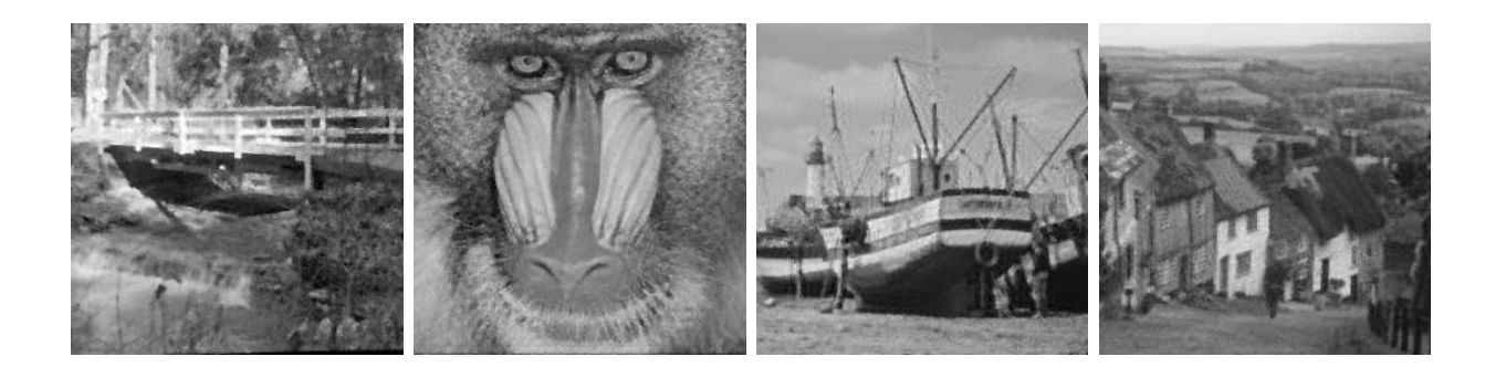
Fig. 5. Restoration of our method for images blurred with out-of-focus kernel of radius 3, and then corrupted by salt-and-pepper noise s = 70%. The parameters used are the same as in Figure 4 for s = 70%.