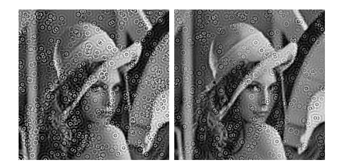
Fig. 2. Lena image blurred with out-of-focus kernel of radius 3, and then corrupted by impulse noise. The image is restored by minimizing (3)–(4) with \varphi(t) = \sqrt{t^2 + 10^{-4}} and \beta = 0.01 . The left is the restored image when s = 1% and the right is when r = 1%.

of impulse noise, the method gives very poor results containing numerous spurious concentric rings. Essentially, the impulse noise got deblurred. We note that no improvement can be expected even if one takes the original TV regularization term or any other function \varphi satisfying \varphi'(0) > 0 since these functions give rise to stair-casing effect.