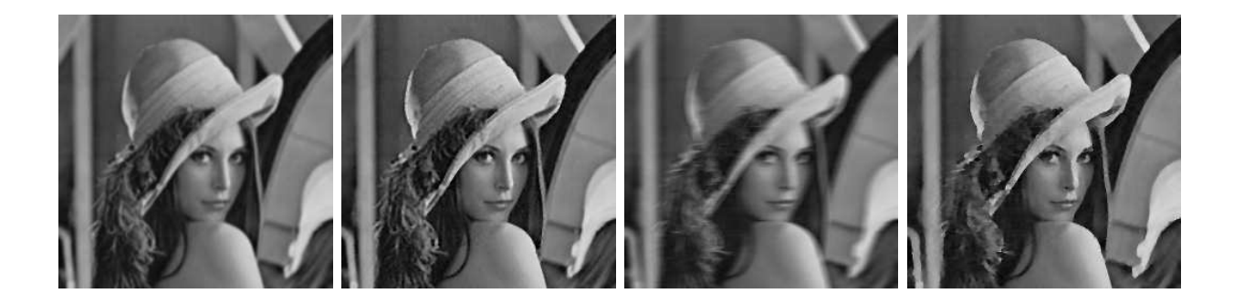
Fig. 6. Lena image blurred with different kernels, and then corrupted by salt-and-pepper noise s = 70%. From left to right: the blurred image with Gaussian kernel (generated by MATLAB command fspecial ('Gaussian', [7 7],1)) with no noise added yet, and the restored image by our method with PSNR 30.6dB; the blurred image with motion kernel (generated by MATLAB command fspecial ('motion', 9,1)) with no noise added yet, and the restored image by our method with PSNR 28.0dB. The parameters used are [ \alpha = 0.002 , \beta = 0.002 , \epsilon = 0.001 ], [ \alpha = 0.005 , \beta = 0.005 , \epsilon = 0.001 ] respectively.

report \tilde{\sigma} in the figure. Again, we see that \tilde{\sigma} is comparable to \sigma when the impulse noise ratio is low, and increases with the impulse noise ratio.