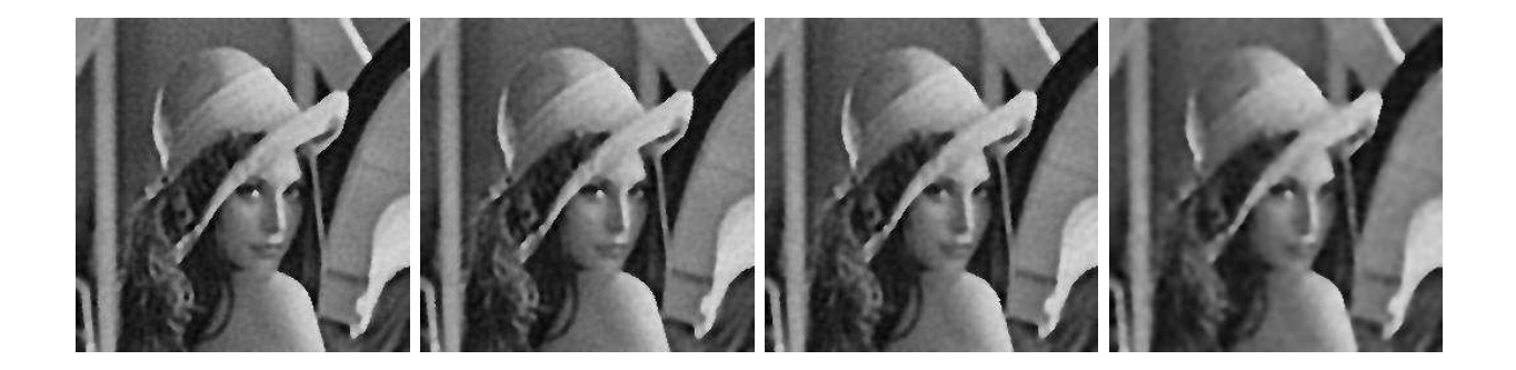
Fig. 7. Lena image blurred with out-of-focus kernel of radius 3, and then corrupted by Gaussian noise with \sigma = 5 (SNR=26.9dB) and salt-and-pepper noise with s = 30%, 50%, 70%, and 90% respectively. From left to right : The restored image by our method with PSNRs 27.2dB, 26.9dB, 26.4dB, and 24.7dB respectively. The parameters we used are all [ \alpha = 0.05, \beta = 0.05, \epsilon = 0.0002 ]. The \tilde{\sigma} is 6.5, 6.8, 7.5 and 11.9 respectively.