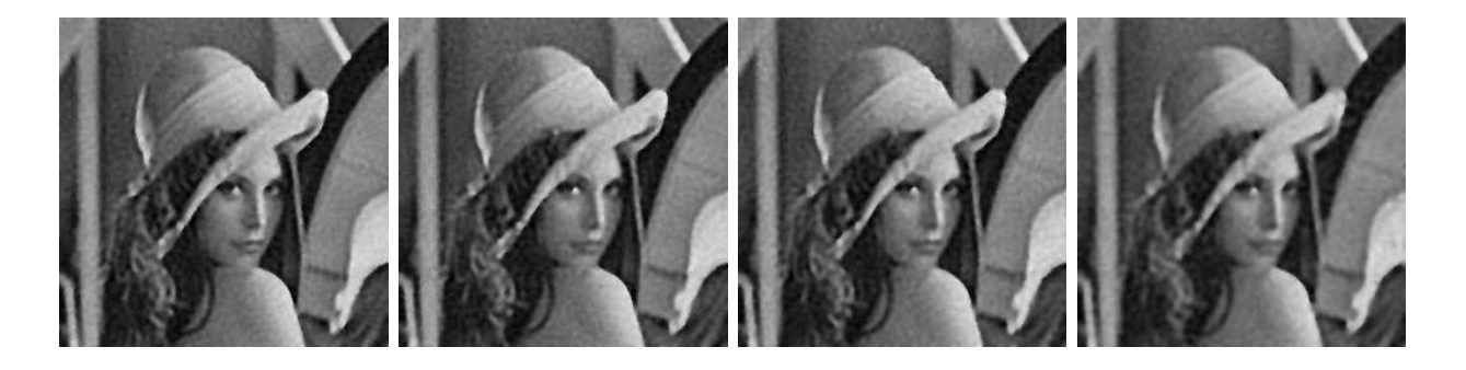
Fig. 11. Lena image blurred with out-of-focus kernel of radius 3, and then corrupted by Gaussian noise with \sigma = 5 and randomvalued impulse noise with r = 10%, 25%, 40%, and 55% respectively. From left to right: The restored image by our method with PSNRs 27.2dB, 27.0dB, 26.7dB, and 25.6dB respectively. The parameters we used are [ \alpha = 0.05 , \beta = 0.05 , \epsilon = 0.0002 ], [ \alpha = 0.01 , \beta = 0.005 , \epsilon = 0.0002 ], [ \alpha = 0.01 , \beta = 0.005 , \epsilon = 0.0002 ], [ \alpha = 0.01 , \beta = 0.01 , \epsilon = 0.0001 ] respectively. The functional minimized is (13) for p = 2 for s = 10% and (13) for p = 1 for others according to Table II. The \tilde{\sigma} is 6.5, 7.0, 8.4 and 11.9 respectively.

detect than the latter. In fact, for salt-and-pepper noise, most of the noisy pixels are much more dissimilar to the uncorrupted pixels, hence filters like AMF can detect almost all the outlier positions even when the noise ratio is very high. However, there is no good detector for random-valued noise when the noise ratio is high. The performance for random-valued noise can be improved if a better outlier detector can be found. Finally, we remark that for both types of impulse noise, we can use ACWMF as noise detector. However, since AMF can already give a good detection for salt-and-pepper noise, we choose it due to its efficiency when compared with ACWMF; see Tables I and II also the CPU times for the first phase.